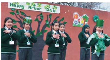
Arbor Day by Class 5th B and 6th A