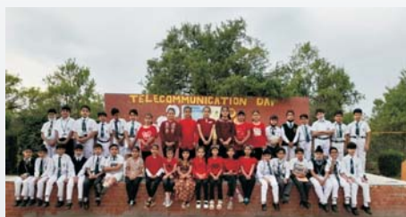
World Telcommunication Day by Class 3rd A