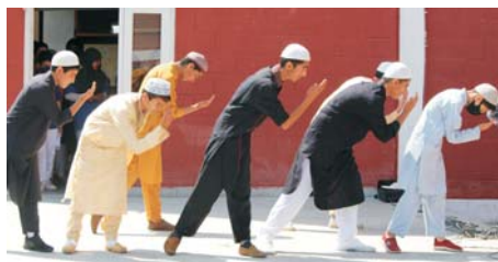
Eid Special Assembly by Class 1st A and 7th B