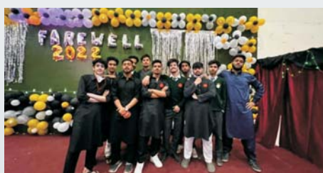
Farewell to the batch of 2022