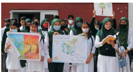
World Earth Day assembly by Class 4th B and 7th A