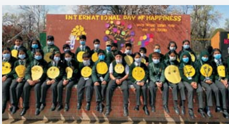
International Day of Happiness assembly by Class 5th C