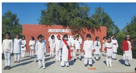
Labour Day celebrations by Class 4th D and 7th C