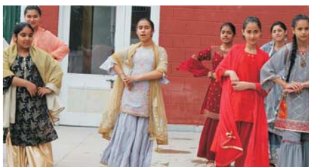
Baisakhi Celebrations by Class 2nd A and 6th F