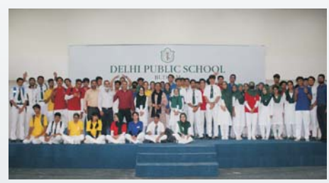
Class 10 Result Celebrations