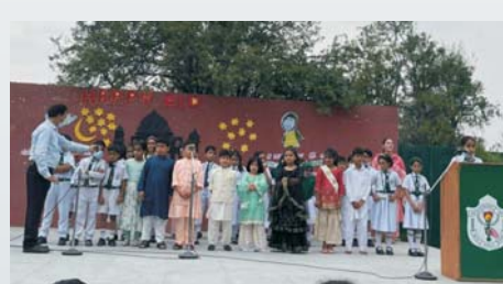
Special Assembly on Eid-ul-Azha by Class 3 F